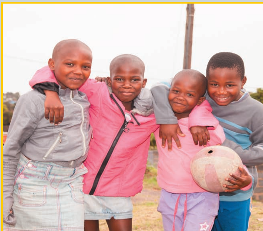
Children should be allowed to participate in sporting activities as part of their development and decision making.

Because of its racial history, access to health care continues to depend on racial background. Different health care facilities are used by different population groups, with 84,8% of black African and 66,1% of coloured child-inclusive households usually went to a public clinic or hospital first, 34,2% of Indian/Asian- and only 12,1% of white child-inclusive households did the same .