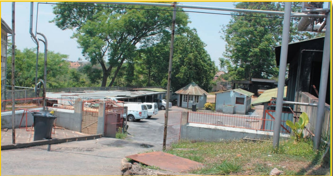
Old infrastructure at the Mpumalanga Hospital in Bushbuckridge

intervention. The walls are cracked and are falling apart, something has to be done as the walls may fall soon on the deceased,” He said.