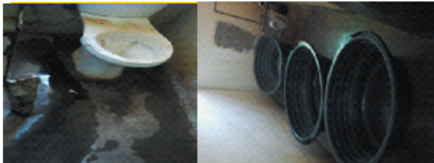
Toilets at Rivoni School for the blinds were found to be broken and in bad condition

The state of the schools was very disheartening as these schools lacked access to qualified teachers,