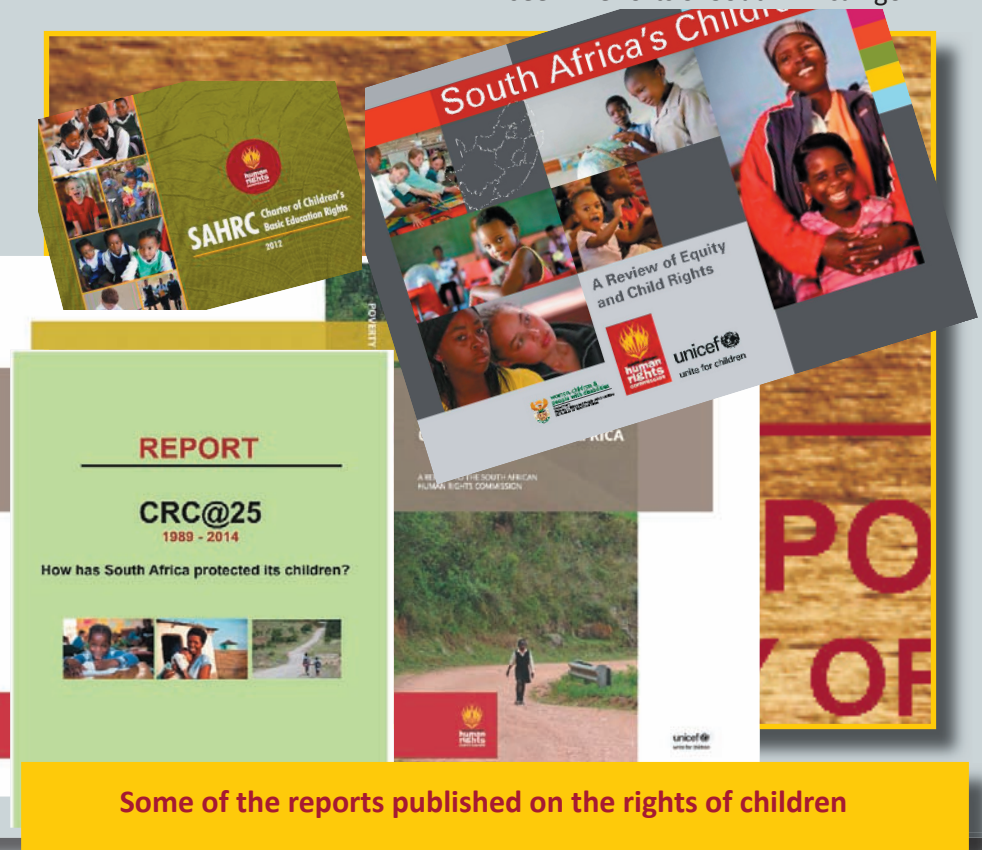
Some of the reports published on the rights of children