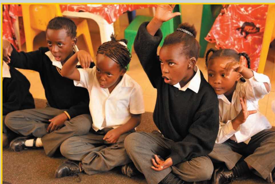
Children need care from parents and society.

There are also challenges such as access to sanitation facilities at