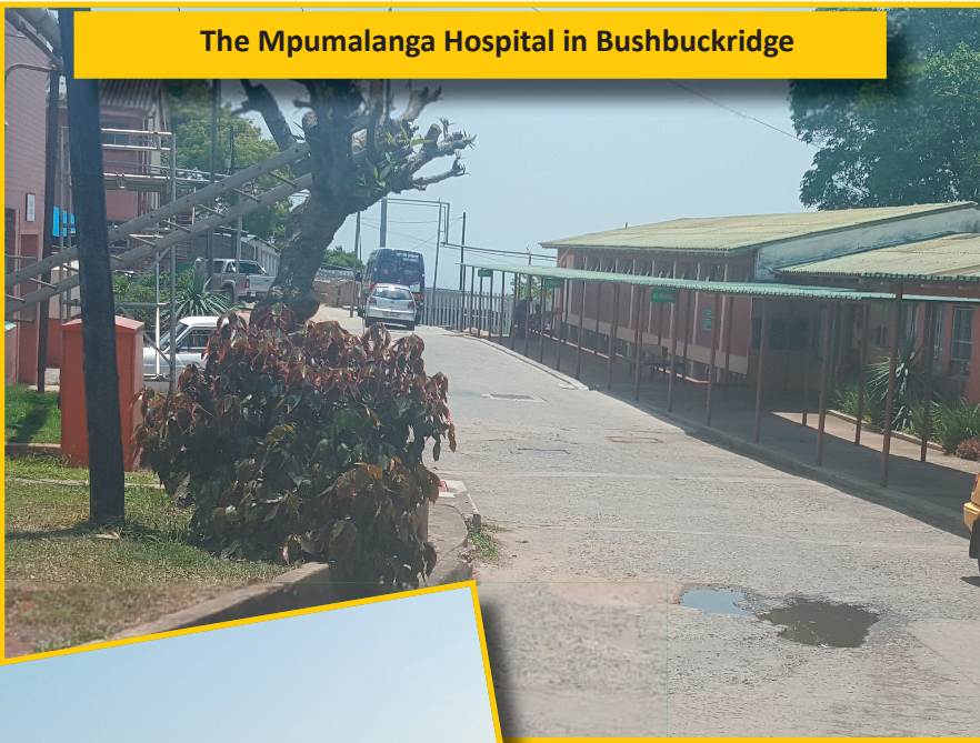
The Mpumalanga Hospital in Bushbuckridge