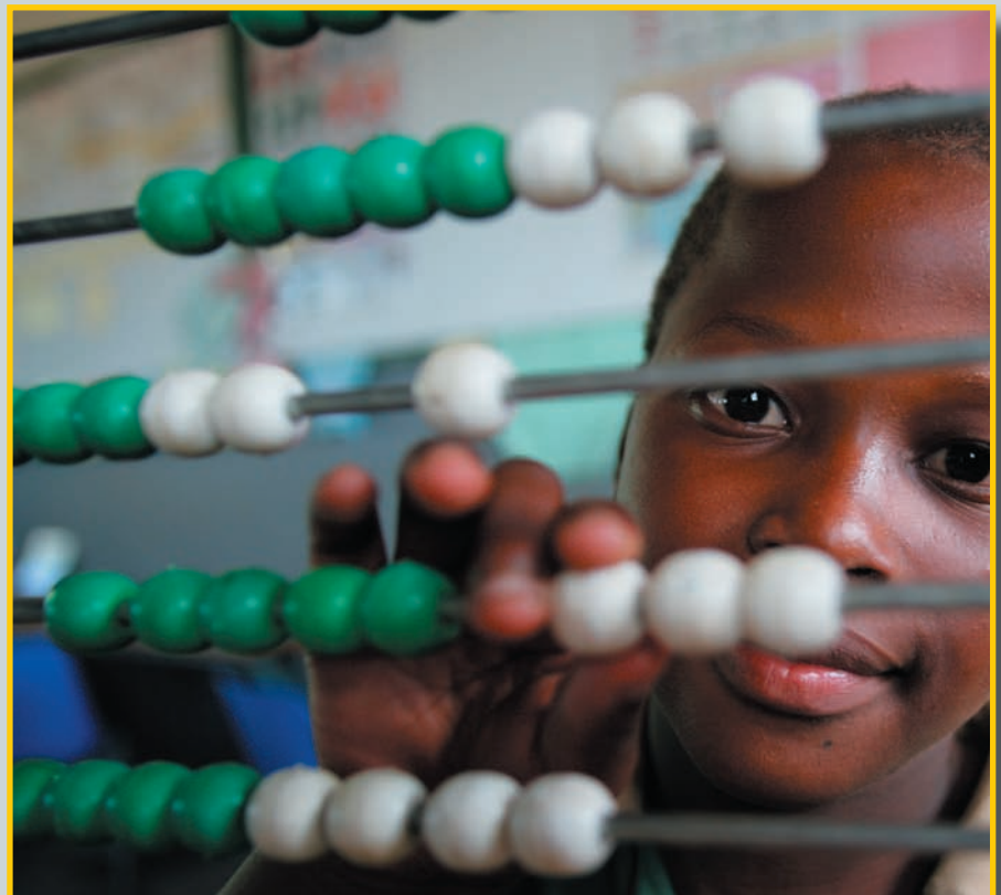
Children have a right to education.

In South Africa there is both public healthcare and private health care.