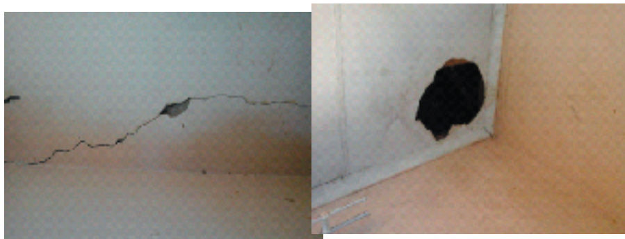
Rivoni school building has cracks which might hurt learners

sign language interpreters, Brailists, mobility instructor or teacher's aids. The schools were dilapidated, dirty and not accessible to the children.